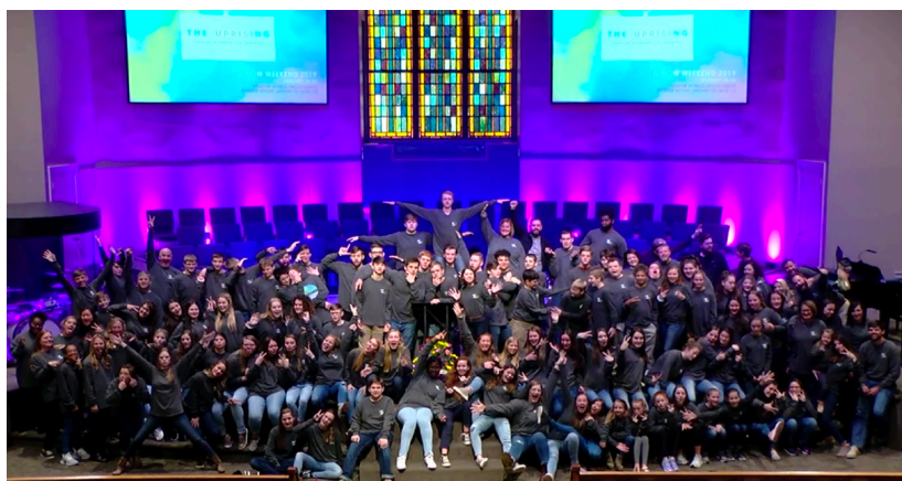
D Now - Winter 2019

One of the greatest things to happen in our ministry this past year was the creation of D-Groups. In 2019 we had 10 students start out in D-Groups, now we have 20+ students reading God's word, memorizing scripture, and committing to prayer with one another each week. The fall of 2019 brought about an uptick in LifeGroup attendance as well and that has carried into 2020. We are excited about what God is doing in the lives of our students through His word and through prayer.