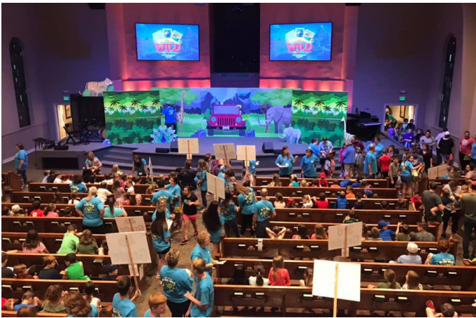
VBS 2019 - Day 1.

UPWARD: This past year we had 206 children participate in our Upward basketball and cheerleading program and another 36 volunteers coaching and helping during the season. Those 206 players generally translates to about 500 people (between players, parents, and grandparents) that visit our facility each Saturday for games. It's exciting to have the platform to speak truth to that many people each Saturday, many of whom do not have church homes.