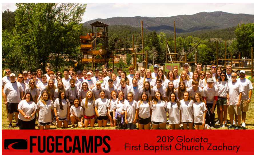
Fuge Camp - Summer 2019

We are excited about what God is doing in the lives of our students and in His church. The Student Ministry is thankful to be a part of a church that loves and cares for the hearts of the students of Zachary.