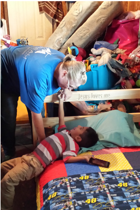
South Texas Mission - Beds - Oct 2019

2019 marked the 10th year for our annual South Texas Mission Trip. Twenty-seven folks went with us and got to experience missions in a "hands on" way. We served through construction at a mission church and fed BSM students at University of Texas-Rio Grande Valley. We sewed and prepared 1,300 Christmas stockings for children. We served at a Respite Center that provides food and clothing to those immigrating to United States. We built, delivered, and set up 10 twin beds for children who did not have a place to sleep. God blessed us to be able to provide the frame, mattress, mattress cover, bedding, and pillow. And finally, through our "Books for the Border" mission effort, we provided 50 kindergarten children and their families with books and bookcases we made for them along and provided 100 additional children with books. Many people provided books, materials and resources for this trip.