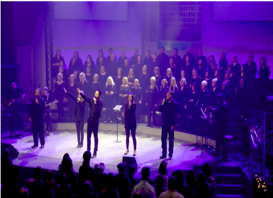
Christmas at First 2019

In 2019, in addition to leading weekly worship services, here is a list of some special times of worship that we had the privilege to be a part of: