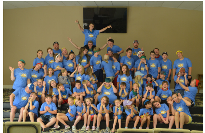
KidsCamp - Summer 2019

KID'S CAMP: This past summer we took 47 children and 10 workers to Judson Baptist Retreat Center for KidsCamp 2019. We lost Monday to Hurricane (Barely) Barry, but quickly made up for the lost fun when we got there on Tuesday. Our Children rode horses, played Bazooka Ball, swam, participated in a challenges class, crafts, did archery and BB guns, and dug deep into God's Word during Bible study, where one child made a profession of faith. Unlike other events during the year, this was just for our FBCZ Children and we had a blast.