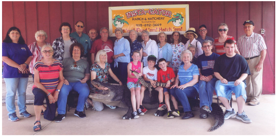
Prime Timers' Trip - Instagator - May 2019