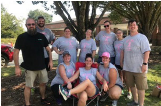
CoEd 4 LifeGroup

LifeGroups, D-Groups, and other discipleship groups are about "Doing Life Together." Our desire is to build and develop relationships with one another as we are growing and strengthening our relationship and walk with the Lord. We accomplish this through authentic Bible study, meaningful fellowship, and intentional service and ministry.