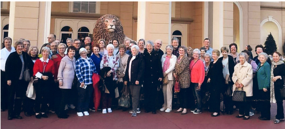
Prime Timers' Trip - Branson, MO - March 2019