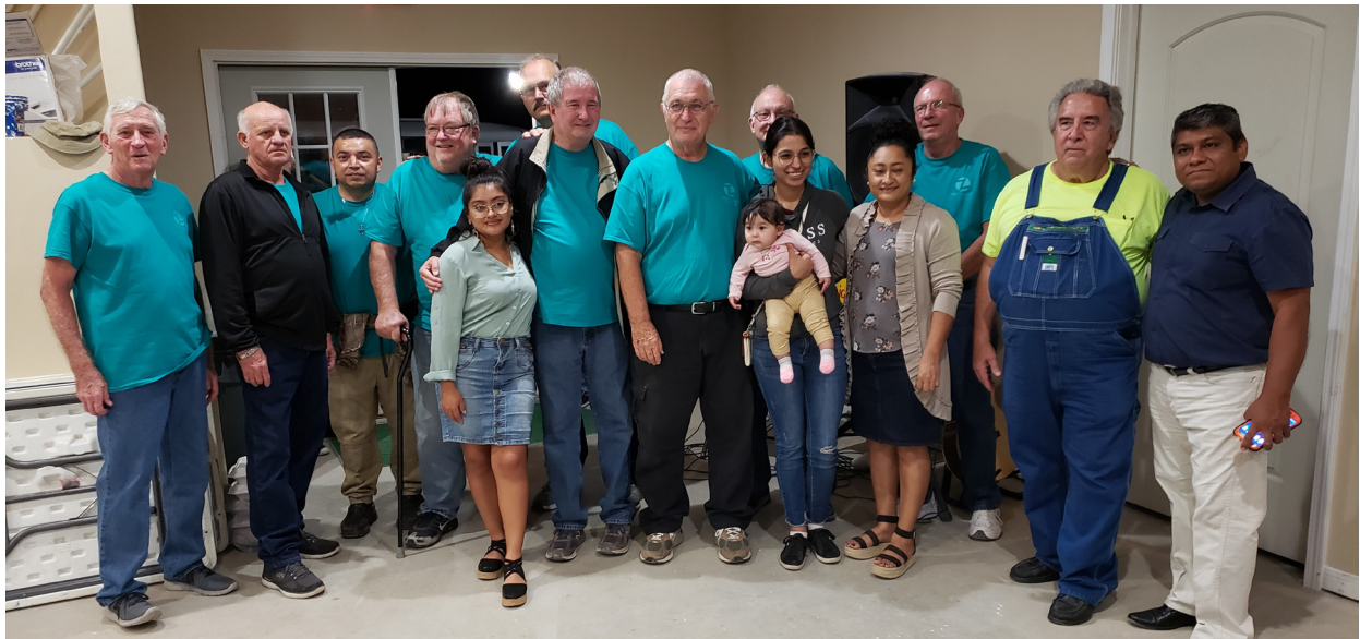
South Texas Mission Trip - October 2019