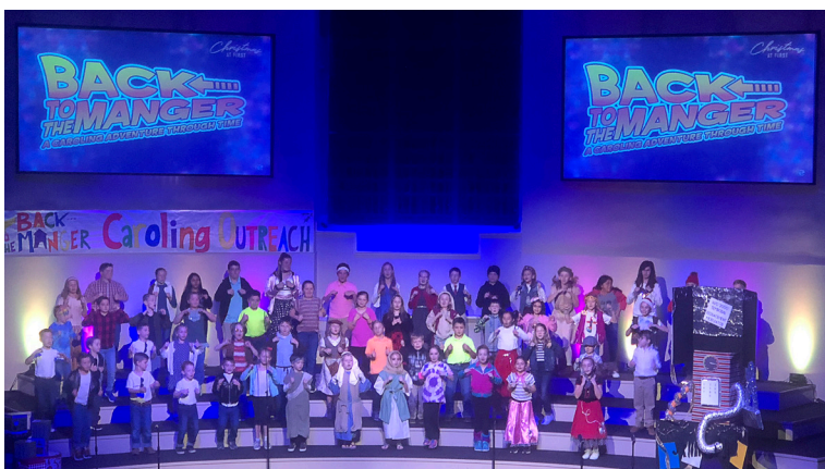
Back to the Manger Christmas Children's Choir Musical - December 2019

We had several new additions to the choir and band which we are always grateful for.