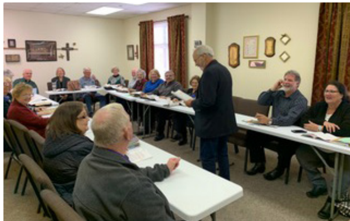
Adult 3 LifeGroup

Our groups support one another through prayer, encouragement, and ministry activities such as bereavement meals, hospital and home visitation, and special projects and opportunities to assist members in times of personal physical, emotional, and financial needs.